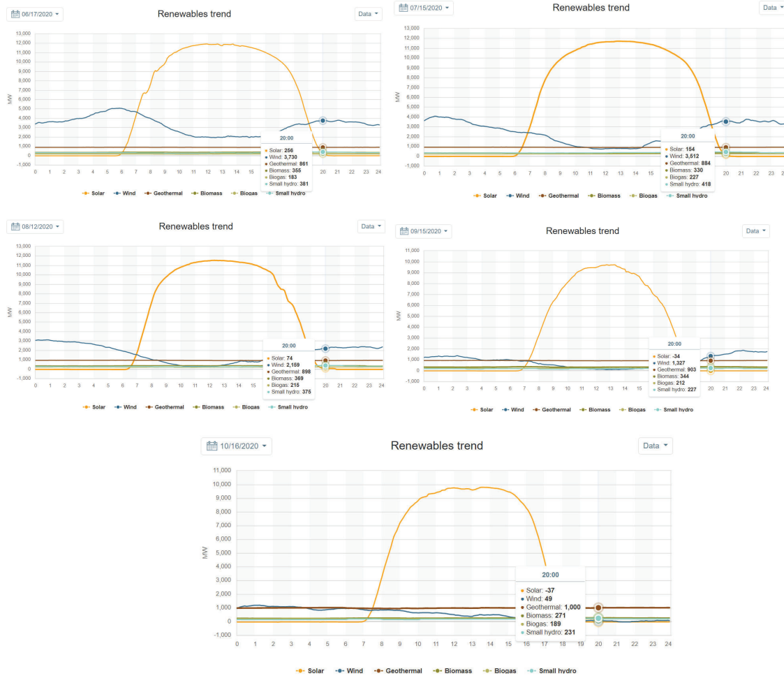
Figure 1: Illustrative Snapshots of Renewable Generation in ISO Footprint mid-June-October 2020

The ISO reasonably assumed zero solar generation in the stack analysis recognizing the minimal solar output at the end of the hour, if not over the whole hour, for the HE 8 p.m. in each of the summer months. For all other resources, the analysis reflects the 2021 net qualifying capacity values available for each month, resources that are expected to be online by summer 2021 by month, and resource adequacy imports based on the historical average from 2015 through 2020 for each month. The total resource stack compares to the California Energy Commission’s 2019 Integrated Energy Policy Report mid-mid managed 2021 hourly demand forecast for the ISO footprint, plus a 17.5% margin. 4