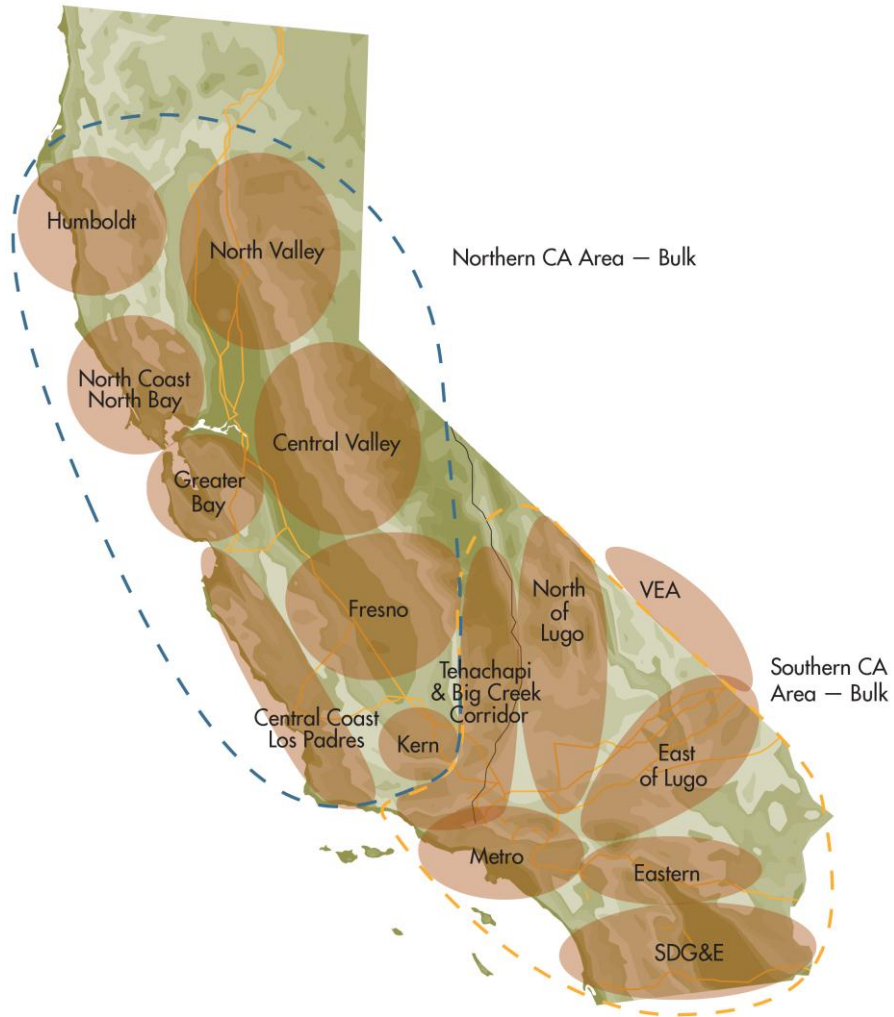
Figure 4.4-1: Approximated geographical locations of the study areas