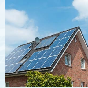
Distributed energy resources