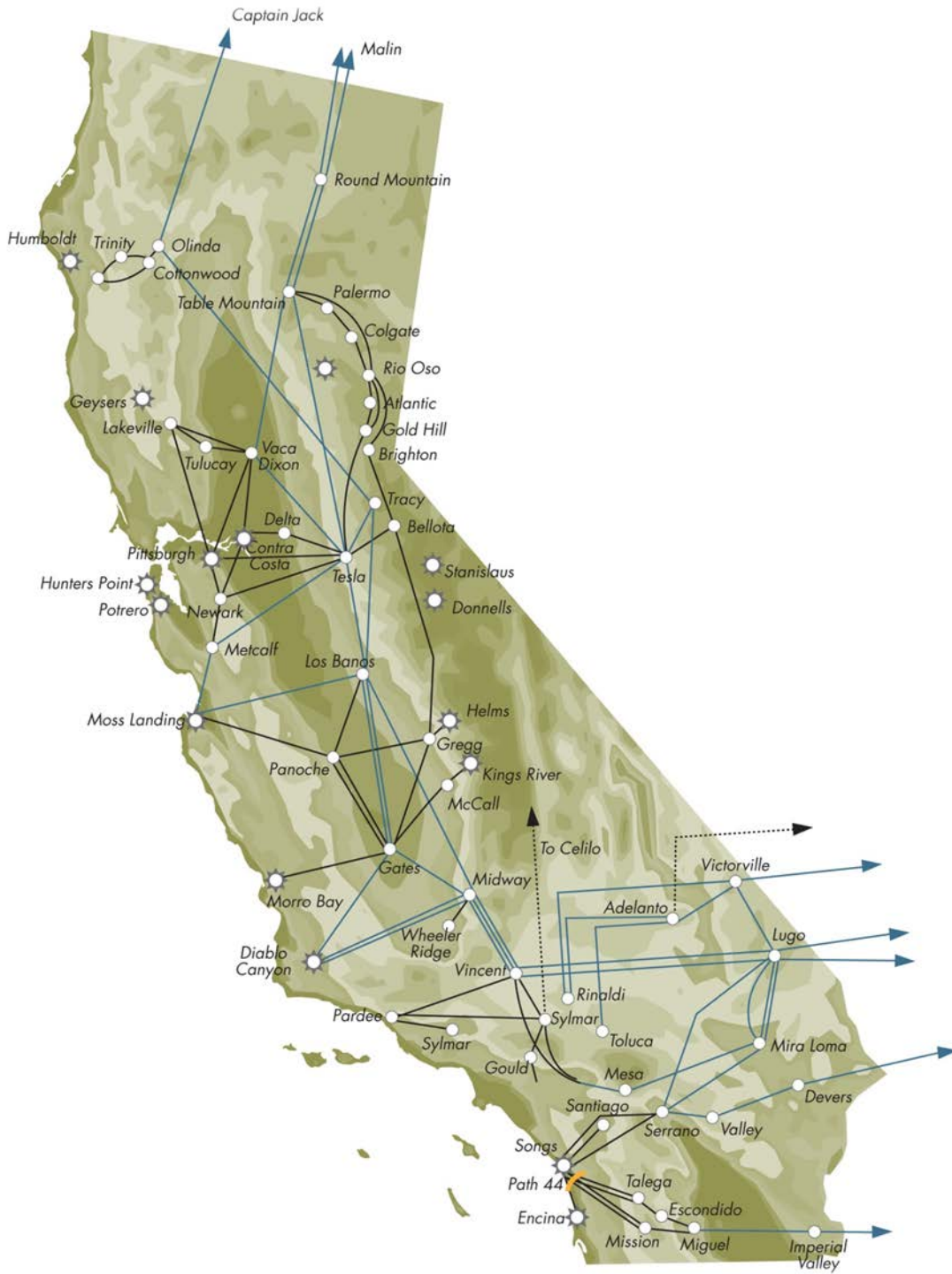
Figure 3-1 Bulk Transmission System

Note: Map is from a general electrical connection and does not represent the line routing or rights-of-way