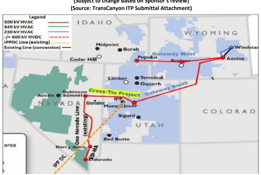
Figure 1: Cross-Tie Project Overview {Subject to change based on Sponsor's review}

received federal approval in a Record of Decision published in 1994 but was not constructed. Further, the project would be subject to the state approval processes applicable for Nevada and Utah. In any event, as the project is anticipated to follow existing transmission line corridors, TransCanyon believes that the risk of failing to obtain necessary administrative approval is considered minimal to moderate. According to TransCanyon, the project is expected to be in-service by 12/31/2024.