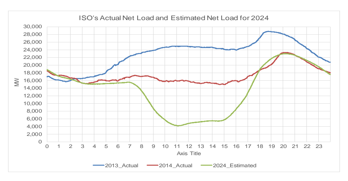
Figure 2: Net Load Curves (2013, 2014 and 2024 Estimated)

The red dots in Figure 1 reflect that the real-time 5-minute energy prices were zero or negative for 43 percent of the total 5-minute intervals for the entire operating day. Negative prices reflect or are precursor to over-generation conditions. The data from April 12, 2014 demonstrates that on some days, especially on weekends and holidays, the CAISO's supply portfolio consists largely of variable energy resources. As greater amounts of variable energy resources interconnecting with the CAISO by 2020 and in future years, the CAISO anticipates that during some operating hours wind and solar coincident production could exceed 60 percent of the total supply mix. Figure 2 illustrates how the net load has changed and how the CAISO expects it to change by 2024 based on the current trajectory of variable energy resource development.