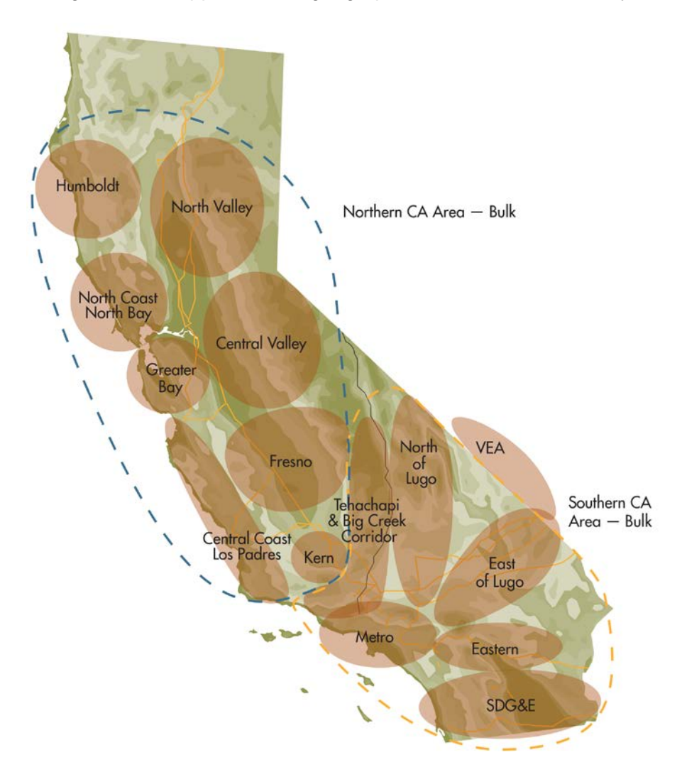
Figure 4.4-1: Approximated geographical locations of the study areas