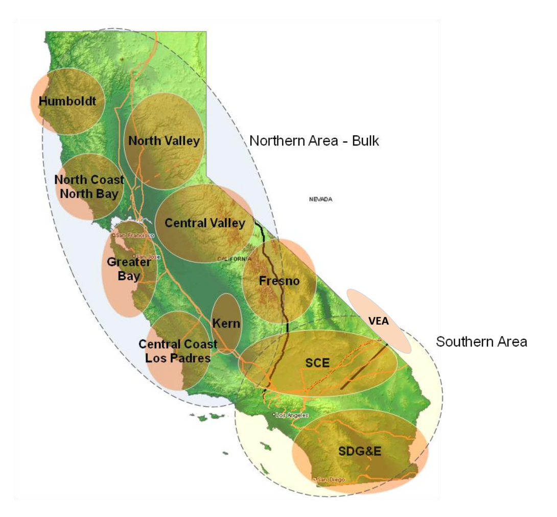
Figure 4-1: Approximated geographical locations of the study areas