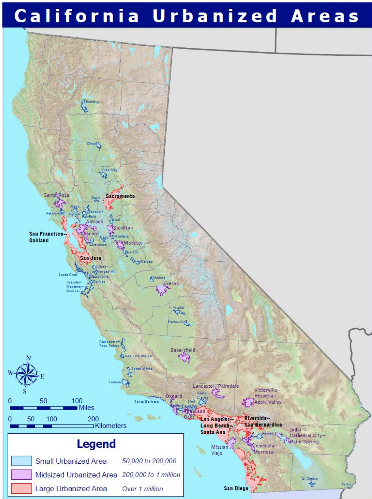
Figure 1: Urbanized Areas in California